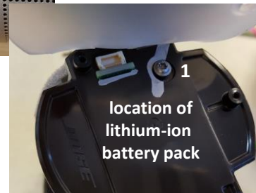
top of unit

Carefully slide the battery pack out of the unit.