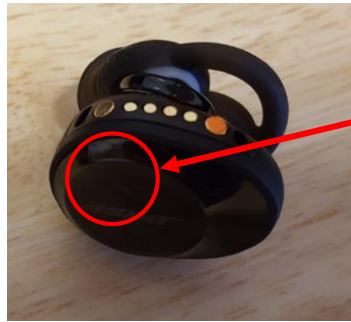
Coin-cell lithium-ion battery location

Note the coin-cell lithium-ion battery location. Avoid damaging the battery while opening the product.