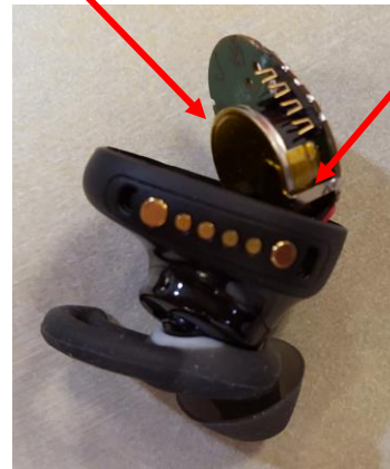
Terminal to be clipped