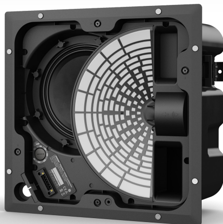
EdgeMax EM180 loudspeaker

Exceptional audio quality, hidden in plain sight.