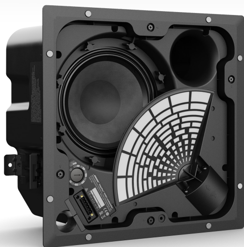
EdgeMax EM90 loudspeaker