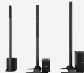
L1 Portable Line Array Systems