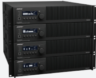
PowerMatch PM8500/8250/4500/4250 configurable power amplifiers