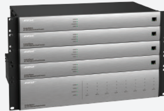
ControlSpace ESP-880/1240/4120/1600 and ESP-00 II engineered sound processors