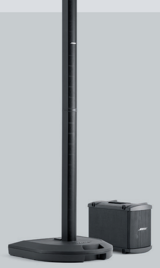
Bose® L1® Model I portable line array system